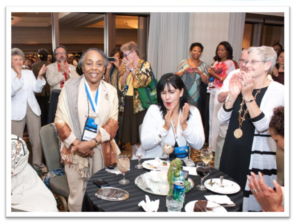
ACNM 57 <sup>th</sup> Annual Meeting & Exhibition Midwives of Color Committee Reception