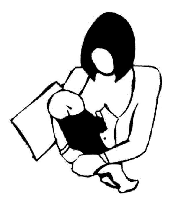
Figure 2. Breastfeeding: face-to-face and belly-to-belly.